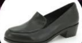
Court Shoe B (1.8")