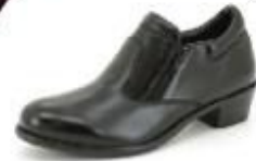
Ankle Boot Female