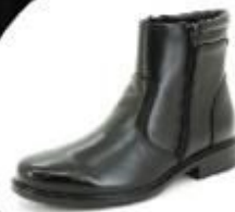
Ankle Boot Male