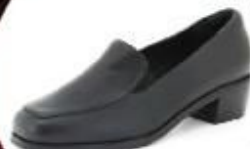
Court Shoe A (1.8")