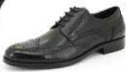
Officer Shoe Male