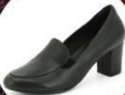
Court Shoe A (2.5")